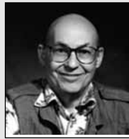
Marvin Minsky, MIT Media Laboratory

Marvin Minsky is the Toshiba Professor of Media Arts and Sciences, and a professor of electrical engineering and computer science, at the Massachusetts Institute of Technology. His research has led to both theoretical and practical advances in artificial intelligence, cognitive psychology, neural networks, and the theory of Turing Machines and recursive functions. He has made major contributions in the domains of symbolic graphical description, computational geometry, knowledge representation, computational semantics, machine perception, symbolic and connectionist learning. In 1959, Minsky and John McCarthy founded what became the MIT Artificial Intelligence Laboratory, and his long tenure as its codirector placed his imprint upon the entire field of artificial intelligence. Minsky is a Fellow of AAAI, and served as AAAI president from 1981-1982.