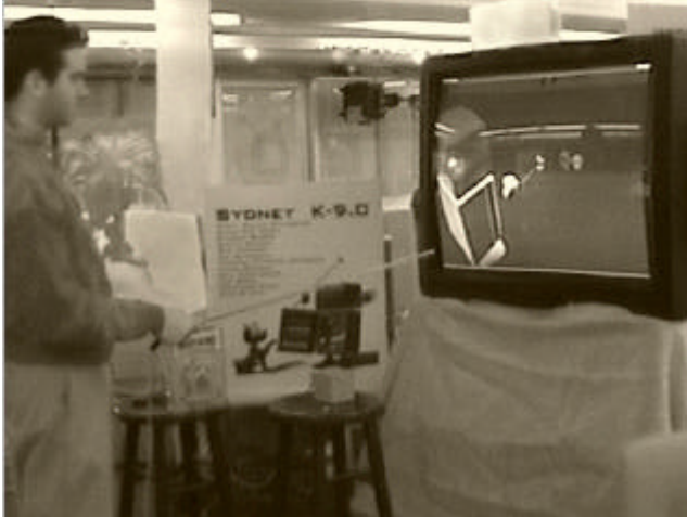
Figure 2. Sydney K9.0 implements a virtual dog training session where Fridge, a refrigerator in the virtual world, is both the trainer and the proxy for the human participant. The participant can provide input to the system with the aid of various interfaces: a wearable microphone, a training stick, a milkbone box and a clicker.

location of the tip of the training stick using a virtual sensor located on the virtual training stick in Fridge's hand. The clicker sound is treated as a special sound signal that is perceived as distinct from the speech signal, even though both are auditory signals. When Sydney's behavior deserves to be rewarded, the human participant shakes the milkbone box, which results in a bone appearing on screen, which Sydney can eat to satisfy his hunger drive. A sensor is installed inside the milkbone box that is activated whenever the box is shaken.