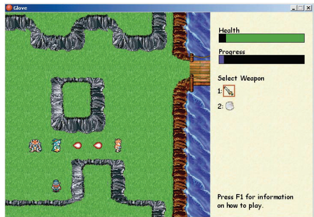
Figure 2: Glove .

Glove has three settings for incongruity: a hard one that makes the player lose after having progressed through about