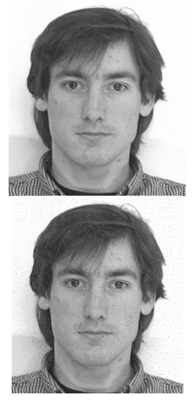
Figure 3. The upper image is clean, and the lower one contains a steganographically hidden message. Note the sporadic black pixels of the stego image, resulting from hiding a message with the HideAndSeek tool.

Most steganographic techniques for content-based file formats randomly place the hidden message in the image, which is obvious to the human eye (Figure 3) but is surprisingly difficult for a machine to detect. This is to be expected as our properties are for the entire canvas and it is impossible that a standard signature exists for all images for the entire image. However, by looking at the image we can see that an implicit signature exists for most clean images, namely that pixels in a region all have the same color. We believe that by dividing an image into regions and then measuring the number of outlier pixels in each region we can differentiate stego images from clean images. We intend to try to divide an image into regions using techniques such as spatial clustering and self organized maps (Kohonen, 1982). We will try to determine the number of outliers using traditional data mining and machine learning, but this may be difficult due to the spatial nature of the data. We intend to apply Gibbs restoration techniques (Geman and Geman, 1984) to determine the number of restorations to perform for each section. For unaltered images we expect that background regions will have few if any restorations. We can colloquially consider a restoration as being where the eye notices an anomaly.