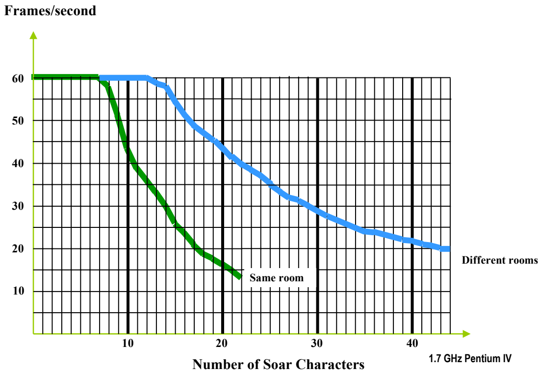
Figure 2: Game update rate as a function of number of Soar characters.

In this project, we are creating an environment in which we can do research and development of new computer games where human-level AI plays a critical role. To be successful, we need not only develop human-level AI characters, but also demonstrate that they are critical for creating a compelling game. These intertwined goals make the project both exciting and challenging. A critical part of our success rests on developing the infrastructure to support the research. Some of the infrastructure we borrowed from our earlier work on Quake 2 and all of it is informed by those experiences. One of the biggest lessons we have learned is to create modules with well-defined interfaces so that we can reuse our software. Quake 2 and Unreal Tournament are themselves excellent examples of this. We encourage our colleagues to work with us to define additional modules that can be shared among our