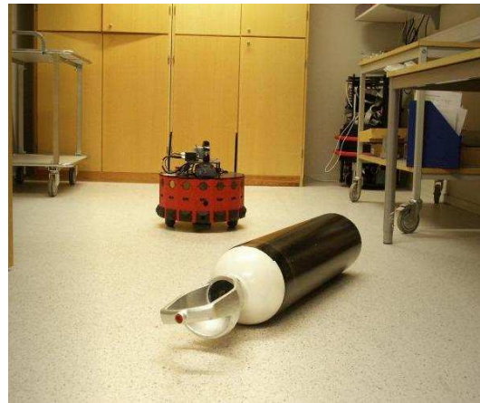
Figure 2: Our robot investigating a gasbottle

Scenario 1: No ambiguity. The first and simplest scenario we have run is when we placed a green gas bottle in the room clearly visible from the robot's location and gave the planner the task to look for and approach b1 with the symbolic