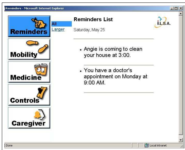
Figure 1: A sample webpage from the elder user interface.

reasons of cost and concerns about privacy—for example, it would have been difficult to find appropriate test subjects who would accept a system with a toilet flush sensor. Each test home had from four to seven sensors, including one medication caddy and several motion detectors. Two installations had a contact switch and pressure mat at the exit door.