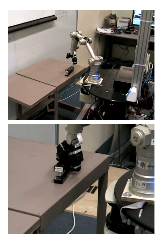
Figure 5: Robot grasping a stapler, using a learned grasping strategy.

Grasping To pick up the object, the robot used the grasping algorithm developed by (Saxena et al. 2006a; 2006b). The robot uses a stereo camera to acquire an image of the object to be grasped. Using the visual appearance of the object,