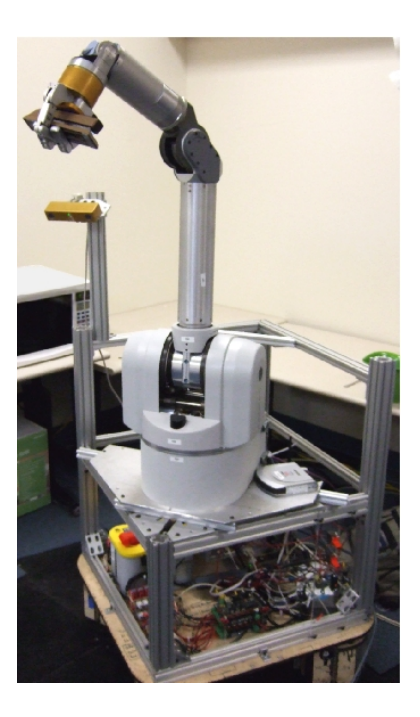
Figure 2: The STAIR 2 robot

measure to avoid damage in the event of an emergency stop, at the cost of increasing the footprint of the robot by a few inches.