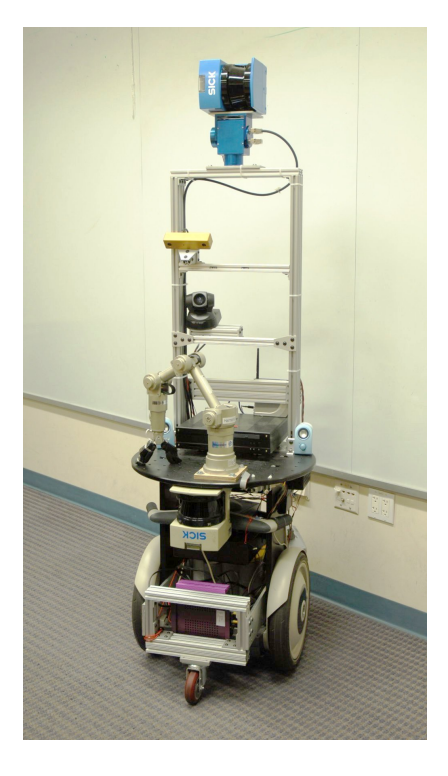
Figure 1: The STAIR 1 robot

This robot, shown in Figure 1, was constructed using largely off-the-shelf components. The robot is built atop a Segway RMP-100. The robot arm is a Katana 6M-180, and has a parallel plate gripper at the end of a position-controlled arm that has 5 degrees of freedom. Sensors used in the demonstrations described in this paper include a stereo camera, a