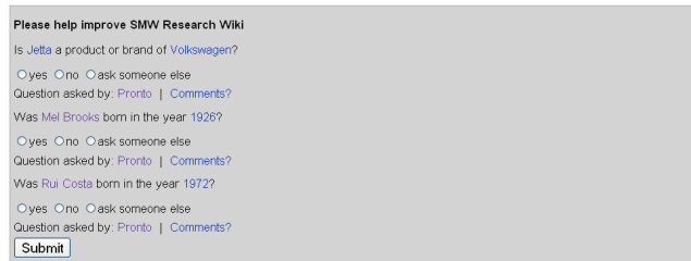
Figure 4: Questions to users might be displayed at the bottom of wiki pages.

The Volkswagen Jetta is the sedan version of the compact car / small family car Volkswagen Golf, manufactured by Volkswagen since 1980. Between 1991 and 2005, the name was only used in North America and South Africa , as it was dropped in Europe in 1991, when it was replaced by the Vento , which was in turn replaced by the Bora in 1998. The Jetta was developed due in part of the Volkswagen marketing group's observation that the North American market leaned more towards sedans as opposed to the Golf's hatchback configuration. Similarly, in South Africa , the Jetta remains more popular than the Golf. This proved to be a wise move on Volkswagen's part, as the Jetta became the best-selling European car in the United States . The mechanicals are shared with the other Volkswagen A platform cars. Currently, its marketing phrase in the US is "Safe happens".