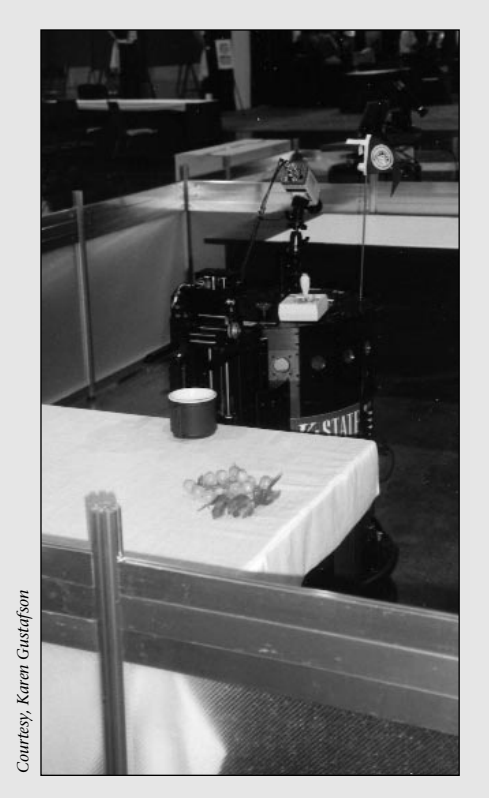
WILLIE Positioned to Pick Up the Small Green Cup.

The robot maintained a metric map of the environment. A number of locations were designated as viewing stations. Because each item was constrained to be in a few locations, the possible viewing stations for each item were associated