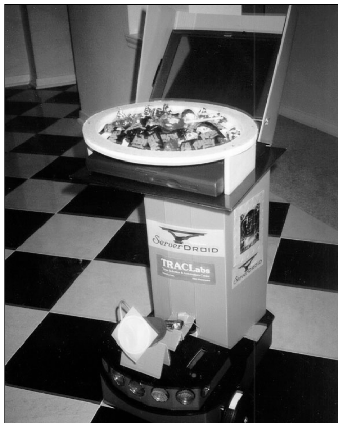
Figure 4. SERVERDROID from TracLabs.