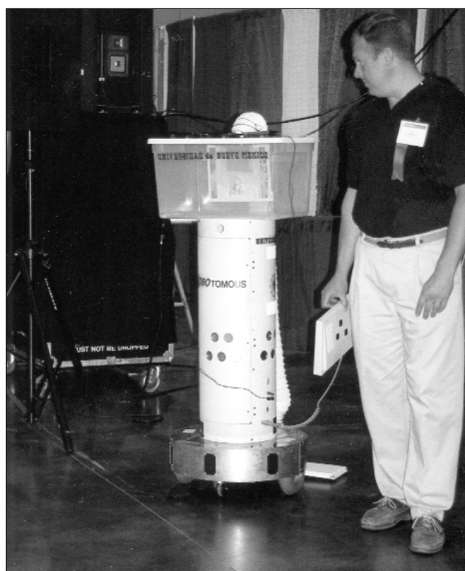
Figure 5. LOBOTOMOUS from the University of New Mexico.