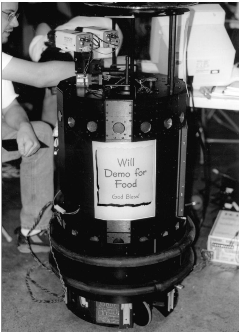
Figure 2. CRISBOT from the Colorado School of Mines.