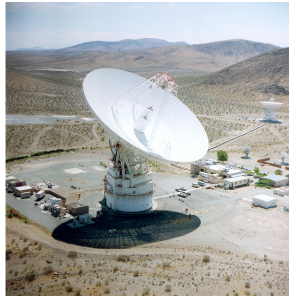
Figure 1. Deep Space Network facility

Schedules are currently manually generated a year into the future with allocations to the minute. These are currently generated a week at a time and average 370 tracks (allocation of an antenna to a mission over a time period) per week. These tracks are typically 1 to 8 hours long and must be allocated in a viewperiod (i.e. a time period when the spacecraft is visible to the antenna). There are around 1650 of these viewperiods defined per week. The DSN's goal is extend the schedule out to ten years where they are currently just predicting and adjusting resource loading based on coarse requirements. The near-term schedule (within 8 weeks) additionally considers the allocation of service-specific equipment, personnel controlling the antennas, and some additional geometric constraints on pointing the antenna. In this paper we describe how we are working with missions to employ scheduling algorithms to generate and repair mid-range (8