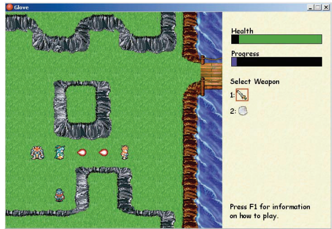
Figure 2: Glove .

Glove has three settings for incongruity: a hard one that makes the player lose after having progressed through about