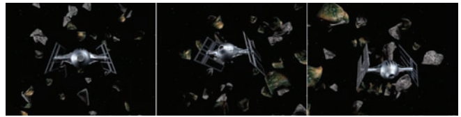
Figure 3: Spaceship pilot test bed. The pilot’s goal is to cross the asteroid field (forward motion) as quickly as possible with no collisions.

To gain a point of reference and to illuminate the interesting computational properties of our technique, we analyzed learning the policy through reinforcement learning (Table 2). This analysis helps validate why a non-RL approach is important in fulfilling our goals. It is straightforward to formulate our case study as an MDP. The state and action spaces have already been defined. We have a complete model of the deterministic environment (needed for animation), the initial state is a position on one side of the asteroid field, and the reward structure is positive for safely crossing the field and negative for crashing. However, even using state-of-the-art table-based techniques for solving large MDP’s [Wingate and Seppi, 2005], it is currently implausible to perform RL with a continuous state space of dimensionality greater than 6 (this size even requires a supercomputer). Our MDP state space dimensionality is 9. Even gross discretization is intractable: e.g., for 10 divisions per axis, 10^9 states. The best result reported in [Wingate and Seppi, 2005] is a 4-dimensional state space discretized into approximately 10^{7.85} states. We also experimented with learning a policy through function-