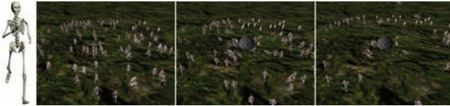
Figure 4: Virtual human crowd test bed.

eral brief demonstration iterations, randomly placing some static characters in a scene. The human trainer then guided the learning agent through the scene. Thus the agent learned how to behave in response to other agents around it in arbitrary positions.