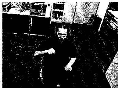
Figure 2: View from the tracking camera.

In the first method, the subject wears distinctly colored cloth gloves on each hand (a yellow glove for the right hand and an orange glove for the left) and sits in a chair facing the camera. To find each hand initially, the algorithm scans the image until it finds a pixel of the appropriate color. Given this pixel as a seed, the region is grown by checking the eight nearest neighbors for the appropriate color. Each pixel checked is considered part of the hand. This, in effect, performs a simple morphological dilation upon the resultant image that helps to prevent edge and lighting aberrations. The centroid is calculated as a by-product of the growing step and is stored as the seed for the next frame. Given the resultant bitmap and centroid, second moment analysis is performed as described in the following section.