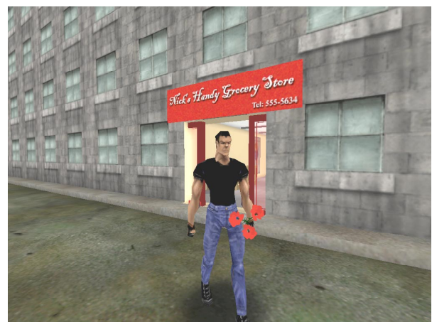
Figure 1: Giving spoken advice to characters.