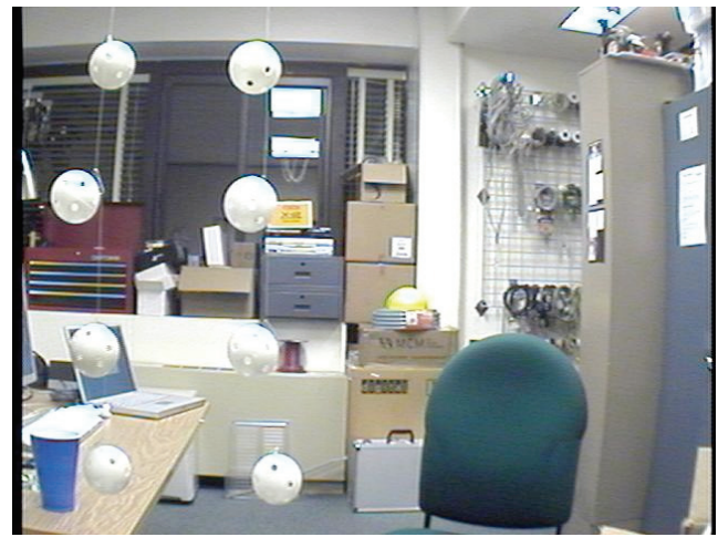
Figure 4: Representation of approximate centers of single switch scanning quadrants.

Suspended balls represented the center of quadrants that could be marked using single switch scanning and indicated a desired object. Targets for the trials were computed prior to all experiments. They were randomly generated and selected taken from the left view of the shoulder camera from quadrants two and three (figure 4). Half of the participants were randomly selected to begin