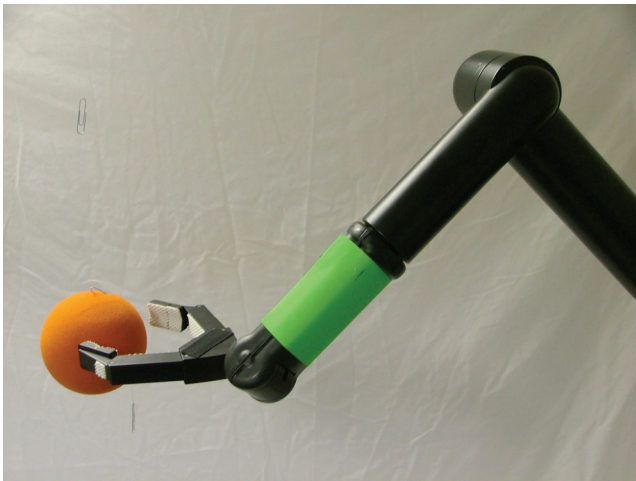
Figure 2: The Manus ARM is shown reaching for the target (orange ball) in computer control.