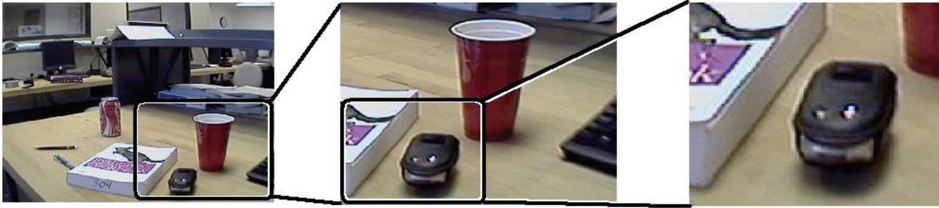
Figure 1: Progressive quartering for single switch scanning on the visual interface.

Research Laboratories evaluated the effects of a Raptor arm on the independence of twelve severely disabled people. The Raptor, a wheelchair mounted robot arm manufactured by Phybotics [Phybotics 2006], has four degrees of freedom (DoF) and a two-fingered gripper for manipulation; it moves by joint reconfiguration, does not have joint encoders, and cannot be preprogrammed in the fashion of industrial robotic arms [Alqasemi et al. 2005]. Significant ( p < 0.05 ) improvements were found in seven of sixteen ADLs. These improved tasks included pouring or drinking liquids, picking up straws or keys, accessing the refrigerator and telephone, and placing a can on a low surface [Chaves et al. 2003].