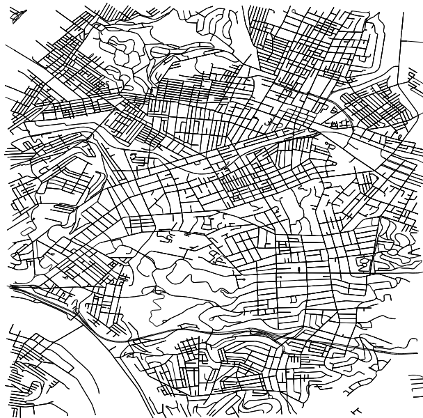
Figure 1: The road network covering a portion of Pittsburgh.

Fortunately, most human behavior is purposeful – people take actions to efficiently accomplish objectives – rather than completely random. For example, when traversing the road network (Figure 1), drivers are trying to reach some destination, and choosing routes that have a low personalized cost (in terms of time, money, stress, etc.). The modeling problem then naturally decomposes into modeling a person’s changing “purposes,” and the context-efficient actions taken to achieve those objectives. When “purposes” have domain-level similarity, we’d expect the notion of efficiency