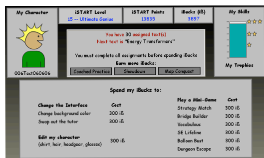
Figure 1. Screenshot of iSTART-ME Menu

read new texts, and interact with game-based features (see Figure 1 for menu screenshot). When students choose to interact with texts and play games, they earn points within the system called iBucks. These iBucks serve as in-system currency and can be used to unlock the game-based features on the interface.