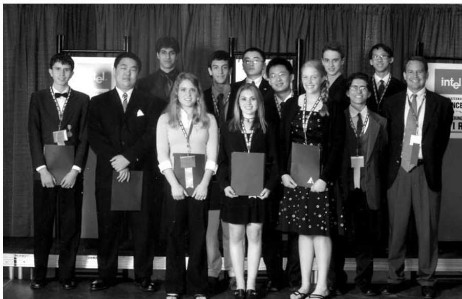
Intel Award Winners.

This year, ISEF was held May 8–14, 2005 in Phoenix, Arizona. There were ten winning projects by twelve students (one team). Five projects were entered in the category of computer science and five were in engineering. The 2005 winners are as follows: