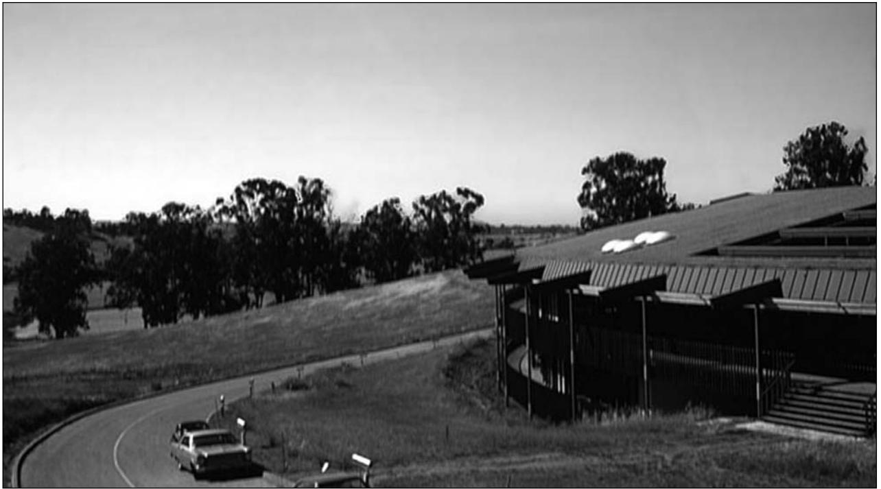
Stanford Artificial Intelligence Laboratory, 1968.