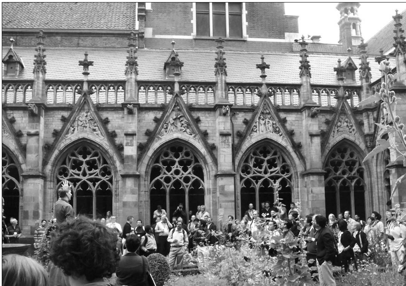
Figure 2. Conference Opening.