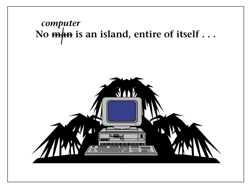
Figure 15. No Man Is an Island, Entire of Itself....

As the acknowledgments make evident, in preparing the Presidential Address and this article, I have had the help of many people. Our interactions were often collaborations. Each of my collaborators, in this work and in my research, has shown me the benefits of collaboration, and my experience collaborat-