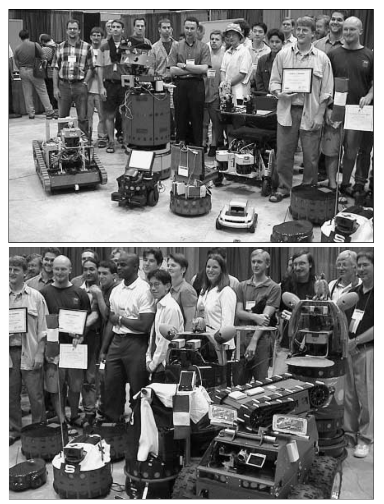
Figure 1. Participants at the Award Ceremony.