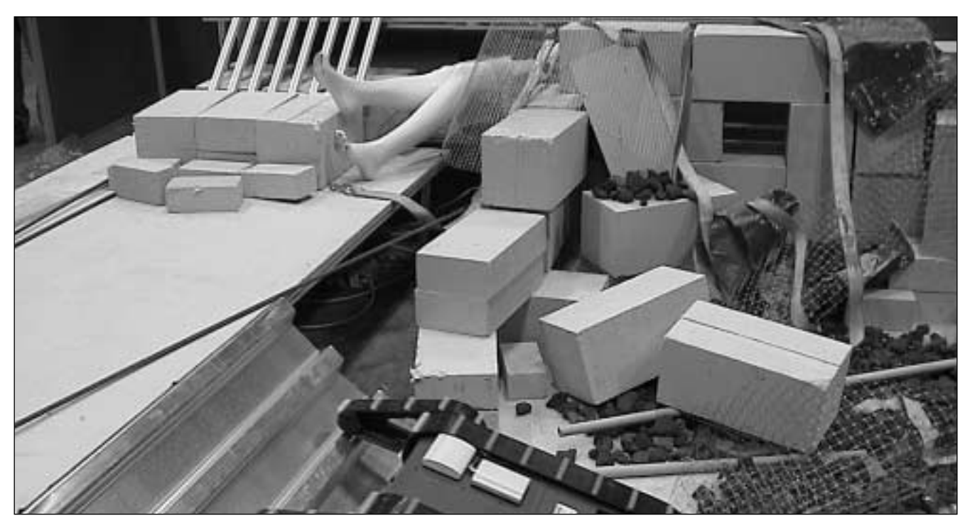
Figure 4. University of South Florida Robot in the Most Difficult Section of the Urban–Search-and-Rescue Arena.