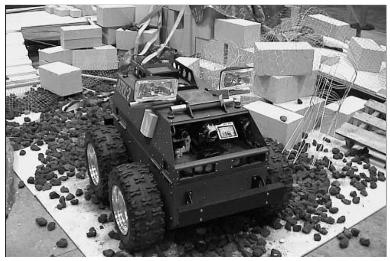
Figure 5. ATRV Robot in Difficult Section of the Urban–Search-and-Rescue Arena (courtesy of William Adams).