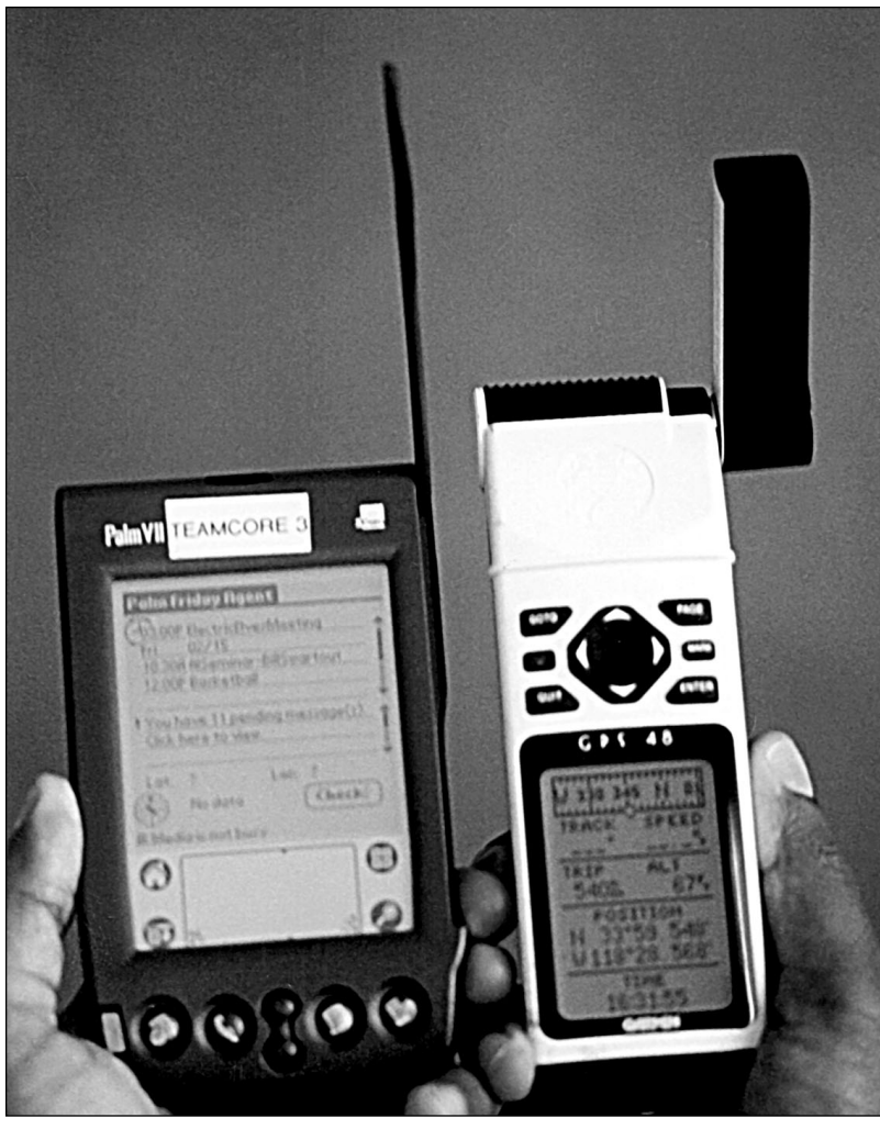
Figure 1. A Palm VII Personal Digital Assistant with Global Positioning System Receiver.

agents, including 9 proxies for 9 people plus 2 different matchmakers, 1 flight tracker, and 1 scheduler running continuously for the past several months. This article discusses the tasks performed by the system, the research challenges it faced, and its use of AI technology in overcoming these challenges.