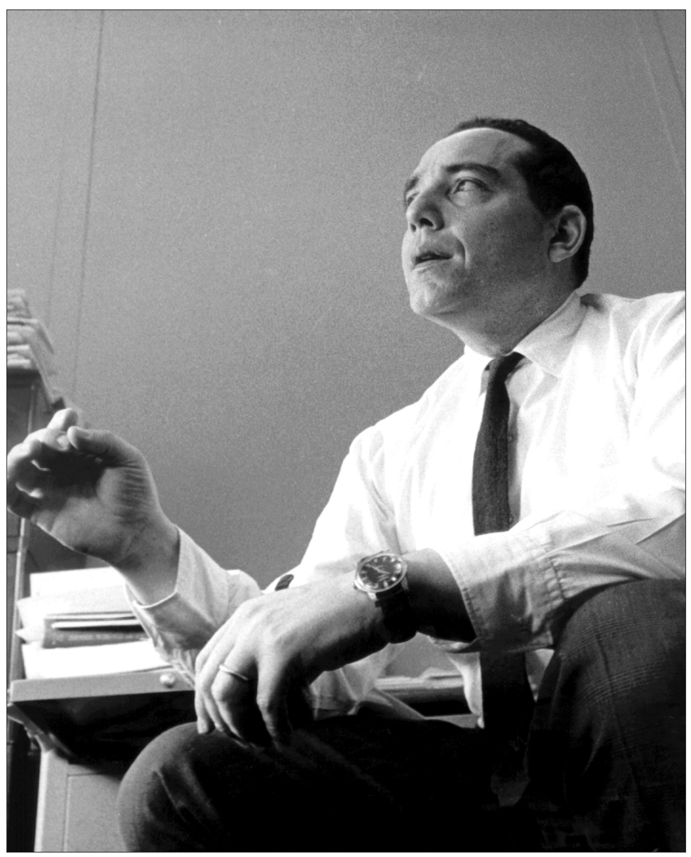
Saul Amarel, February 16, 1928 – December 18, 2002